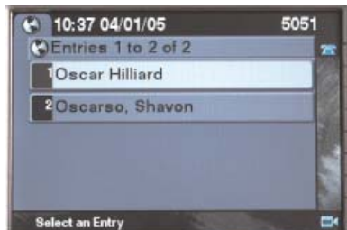
3. Type “7” one time for “s”