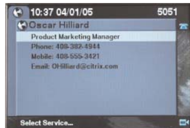
4. Type “2” one time for “c”