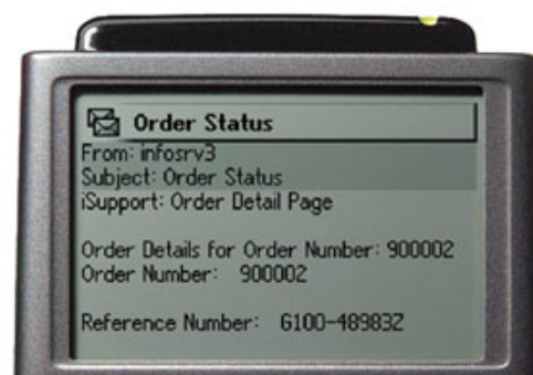
Accessing information with GoodInfo